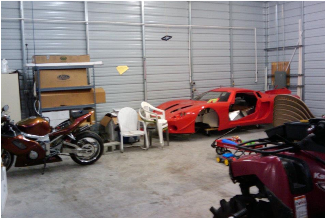
A mere shell waiting for life

Please enjoy this gallery of the GTM built