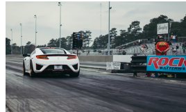
ROCKINGHAM DRAGWAY MARCUS LANE