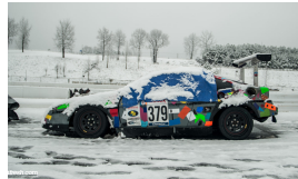
CHAMPCAR 14-HR ENDURO TEAM BABY SHARK

STAY IN TOUCH WITH OUR MEMBERS AND EVENTS